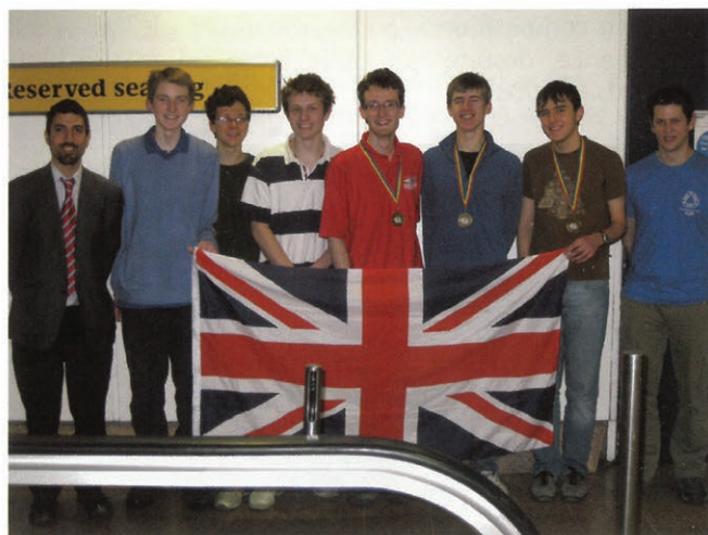
Back at Heathrow with the leaders, flag and medals

four-question exam that constituted the previous years' centrepiece was replaced with two four-and-a-half-hour three-question exams à la IMO.