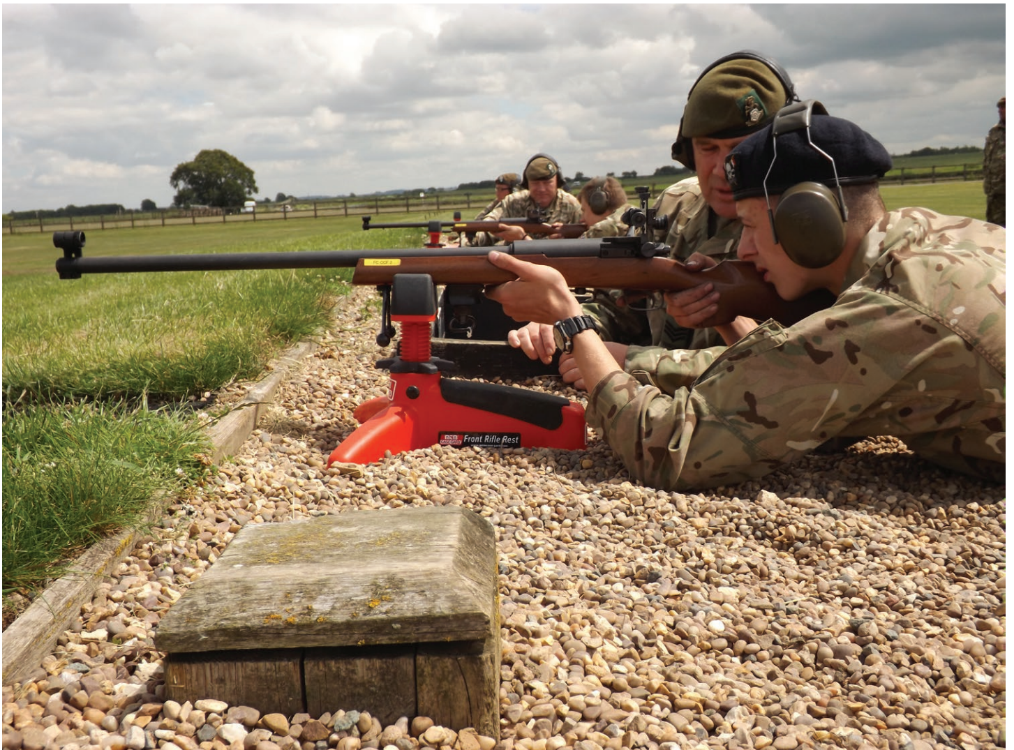
INCLUDING 7.62 TARGET RIFLE PRACTICE.