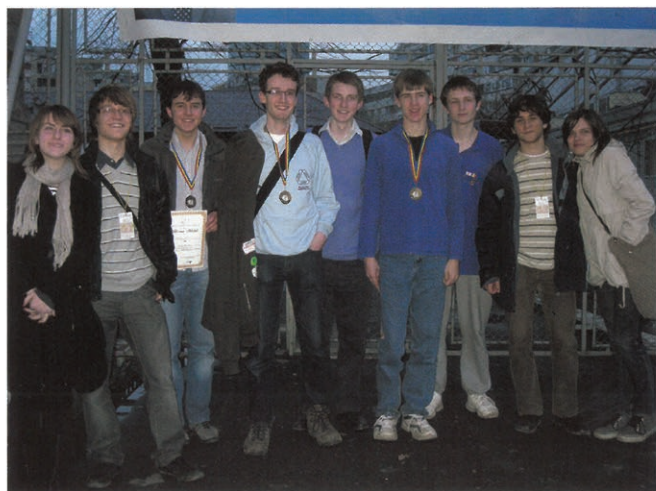
The team (minus one) with our Romanian guides after the closing ceremony

That afternoon was the grand opening ceremony, attended by many dignitaries and a local TV crew; despite joining the EU in 2007 and being accepted as a fairly Westernised modern country, they still seemed very keen to impress their mathematical guests.