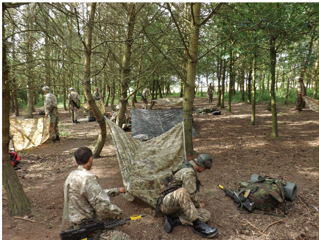
THE CADETS IMPROVED THEIR BUSH CRAFT AND ASSAULT COURSE SKILLS