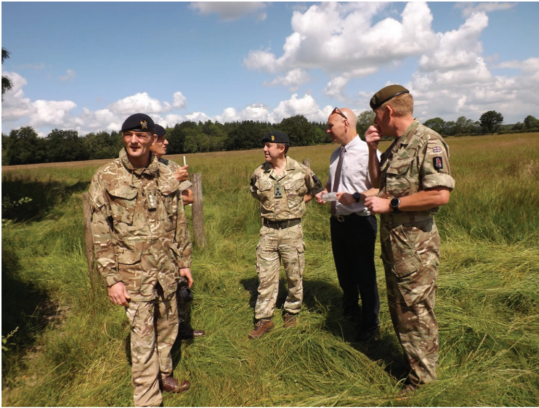
7 BRIGADE COMMANDER JOINED THE CADETS TO SEE THEIR SKILLS FIRST HAND