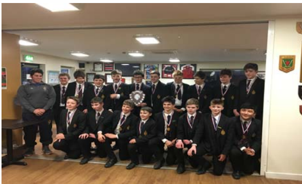
Year 9 King's 27 De Aston 12