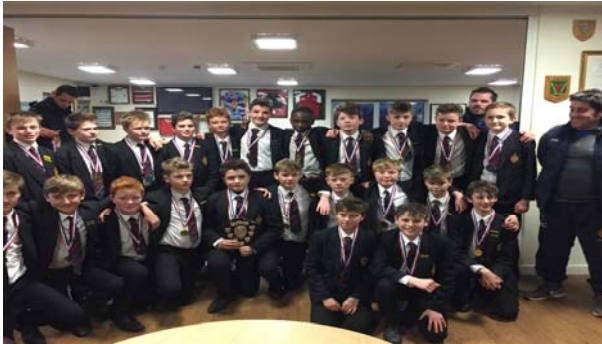
Year 8 King's 50 De Aston 5

Both Year 8 & 9 Teams retained their County Cup titles.