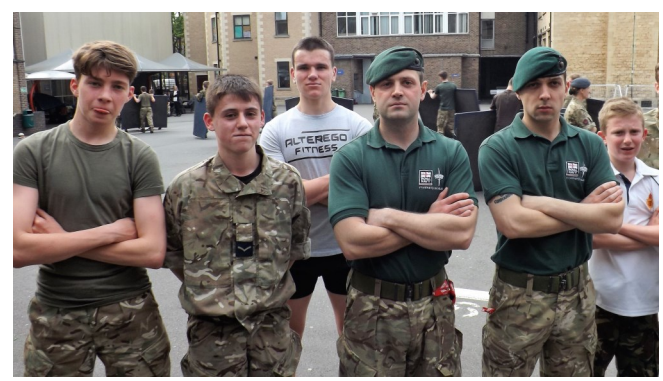
Cadets going through some Royal Marine exercises (below):

Cadets received a presentation on equipment used by the RM and some pictures of their 30 mile yomp across Dartmoor as the climax to their Recruit training. They then had a taste of RM physical training.